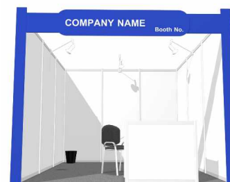
Sample of Standard Shell Scheme